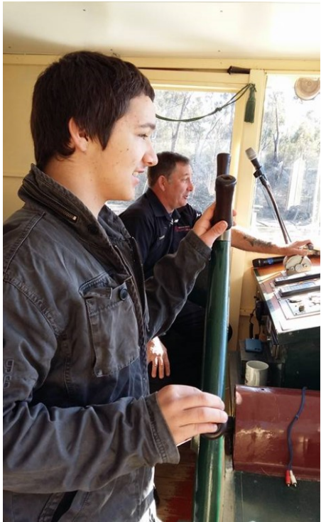
SOME FUN DURING ORIENTATION WEEK AT ECHUCA.