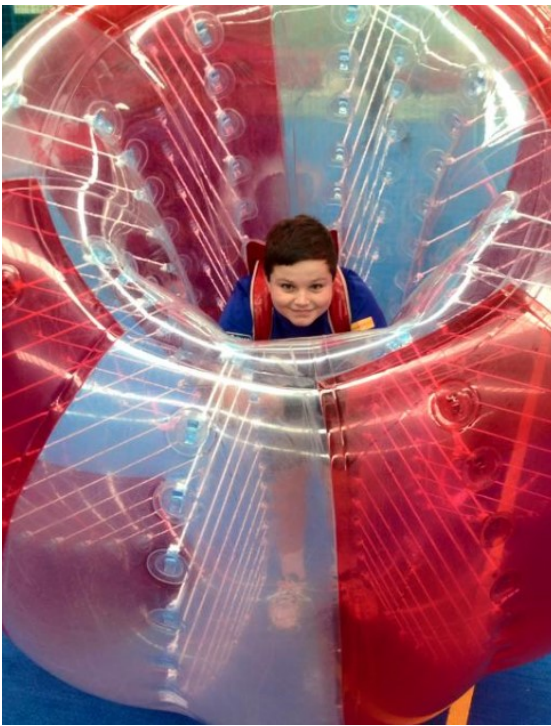
STUDENTS (AND COULD THAT BE JOHN OUR PRINCIPAL) HAVING A GOOD TIME AT BENDIGO MAJOR LEAGUE SPORTS